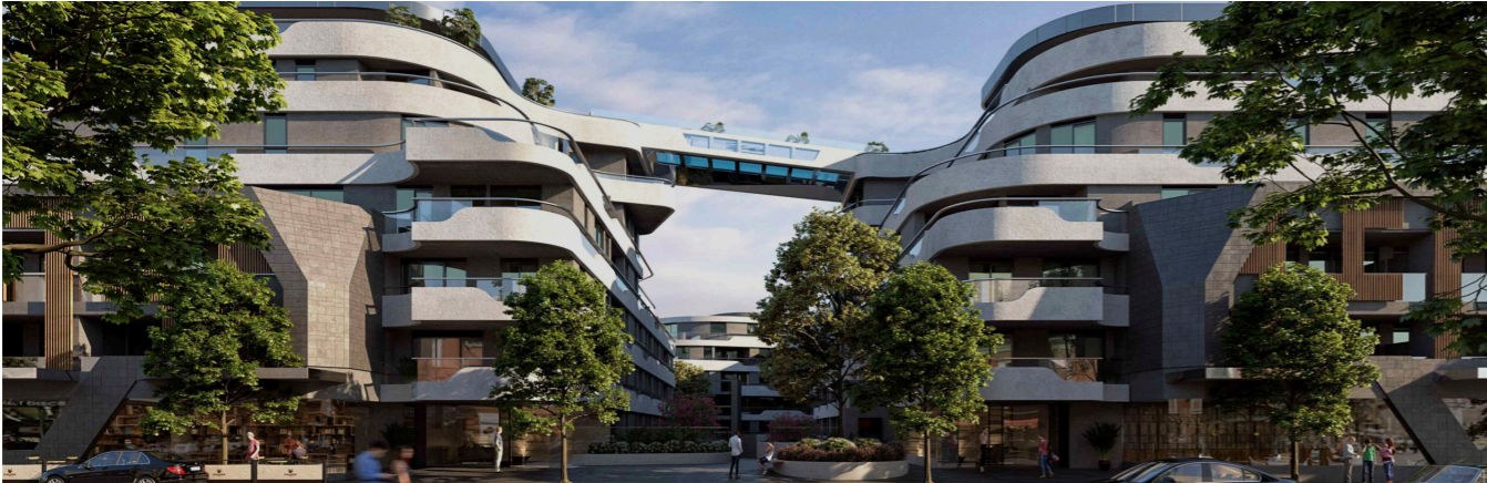
HAWTHORN PARK BASEMENT PACKAGE + ENVIRONMENTAL REMEDIATION

LOCATION: 33-57 CAMBERWELL ROAD, HAWTHORN EAST CLIENT: HICKORY