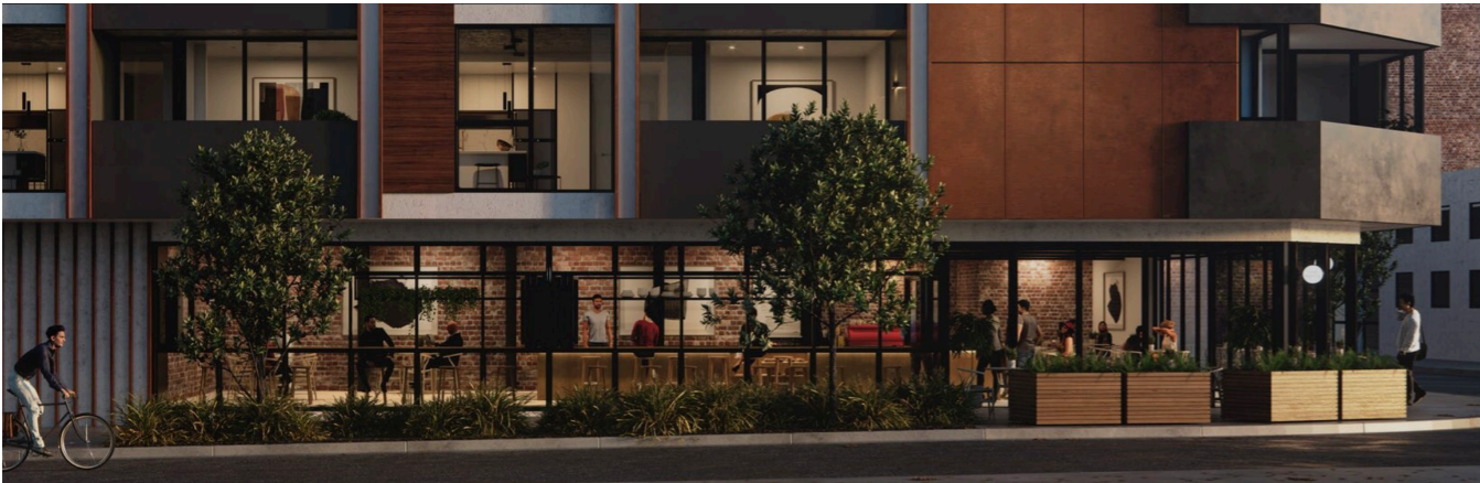
THE MALT DISTRICT BASEMENT PACKAGE + ENVIRONMENTAL REMEDIATION

LOCATION: 33-57 CAMBERWELL ROAD, HAWTHORN EAST CLIENT: HICKORY