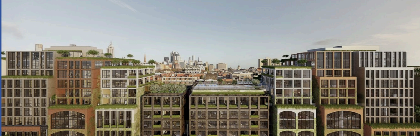
VICTORIA AND VINE BASEMENT PACKAGE + ENVIRONMENTAL REMEDIATION

LOCATION: 1-12 BILLS STREET, HAWTHORN CLIENT: HANSEN YUNCKEN