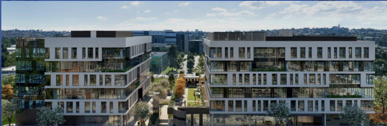
NEXUS CORPORATE MULGRAVE BASEMENT PACKAGE + ENVIRONMENTAL REMEDIATION

LOCATION: 1-57 WELLINGTON STREET COLLINGWOOD CLIENT: HICKORY