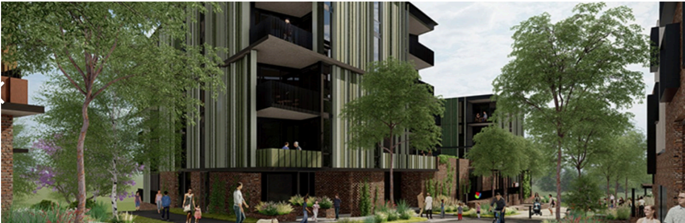
BILLS ST SOCIAL HOUSING BASEMENT PACKAGE + ENVIRONMENTAL REMEDIATION

LOCATION: 2 GOUGH STREET, CREMORNE CLIENT: PROBUILD