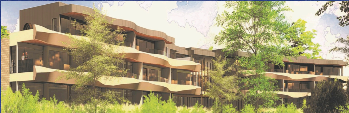
MORGAN ASSISTED LIVING APARTMENTS BASEMENT PACKAGE + ENVIRONMENTAL REMEDIATION

LOCATION: 633 SPRINGVALE ROAD, MULGRAVE CLIENT: SALTA